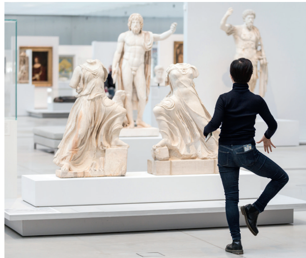
The Gallery of Time © SANAA - IMREY CULBERT - Exhibition design: Studio Adrien Gardère