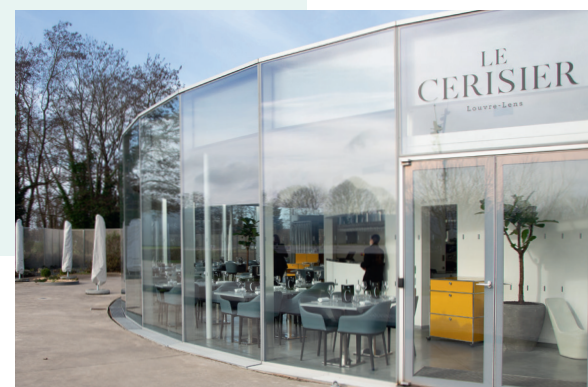
L'Atelier du Cerisier restaurant

Reservations recommended on 03 74 49 62 62