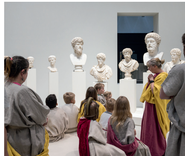
Temporary exhibition 'ROME. The City and the Empire' in 2022

The Gallery of Time forms the heart of the Louvre-Lens. In an open space spanning 3,000 square metres, it presents more than 200 masterpieces from the rooms of the Musée du Louvre. You can follow a unique journey through art history and humankind stretching from the 4th millennium BC to the mid 19th century. Interweaving different eras, techniques and civilisations, the Gallery of Time enables you to discover or rediscover the Louvre's wonderful collections in a new light. Since 2021, it has also been home to eighteen works from Africa, the Americas and Oceania on loan from the Musée du Quai Branly.