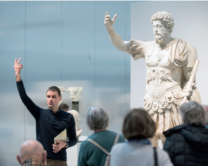
Tour of the Gallery of Time

The right to speak in museum spaces is only permitted for holders of the professional guide-lecturer card (and on presentation of it) or exceptional authorisation by the museum management.